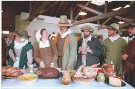
Letters from the 5th grade

I learned that the Wampanoag people had toys that looked the same as the Plimoth Plantations toys. The Plimoth Plantation came in the Mayflower in 1502 and this was after Columbus arrived in 1492. The Mayflower had to live on the icy water in the winter times because they couldn't build houses on water. The Plimoth Plantation lived on the east cost of Massachusetts. Jada Arnold