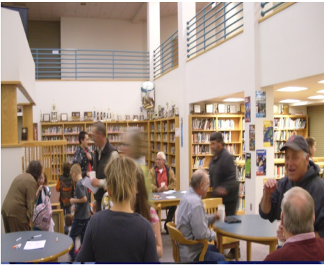
Dads and Donuts, Go Together!

Volume 1, Issue 5 Monday, September 26, 2011